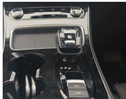
Crystal gear lever