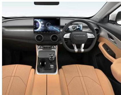
Intelligent Thermostatic Seat