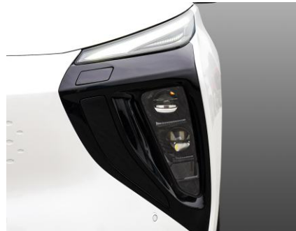
Optional European standard lamp appearance