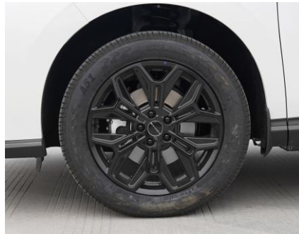
19 Inch Sport Wheels